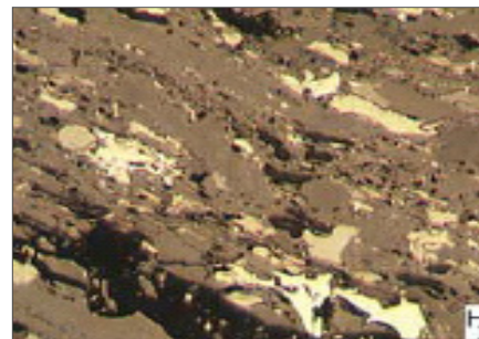
Coal Particle in reflected light (500x)

Email us at minerals@sgs.com www.sgs.com/mining